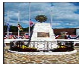
National Fallen Firefighters Memorial