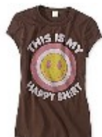
Printed Screen Tees