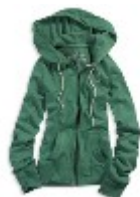
The hoodie sweatshirt

What are you wearing back to school this fall? According to the online edition of Cosmo Girl , girls' back to school basics include: Many girls are continuing to wear the skinny