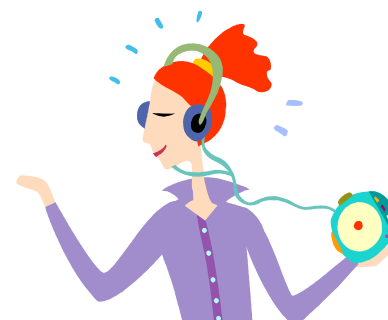
Coming in the September issue, "What's in Your iPod?"

you see a new trend in fashion that you would like to appear in The Wildcat , let us know.