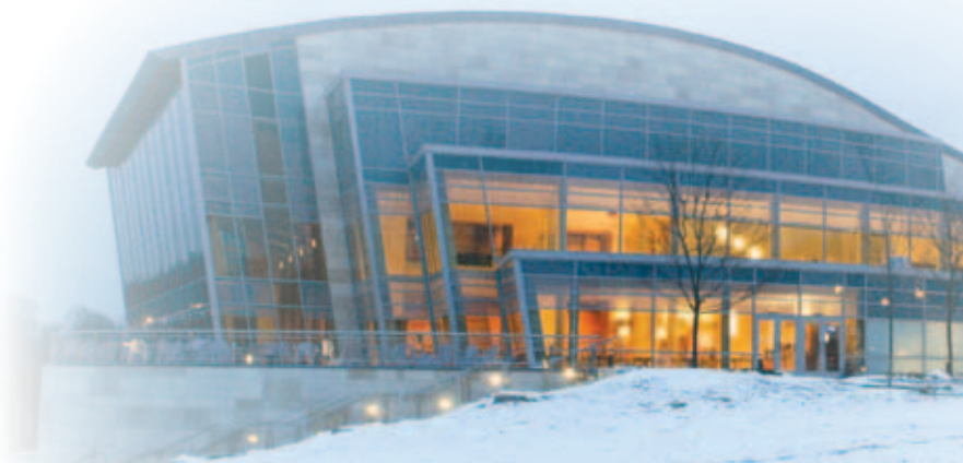
The Music Center at Strathmore

To explore the breadth of Maryland, visit www.visitmaryland.org