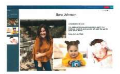
Step 3 Enter your text