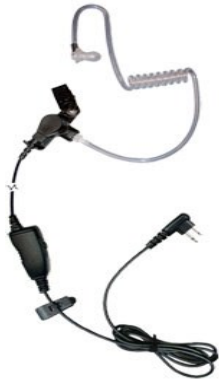
Star Single Wire Ear Bud Coil Tube