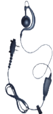
Agent Single Wire Agent C-Hook