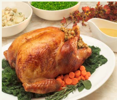
Missing that Thanksgiving turkey? Then eat the turkey at W.G.E.S.!

Every time you see this on the menu, don't get the other boring things. Get the delicious cheese dippers!