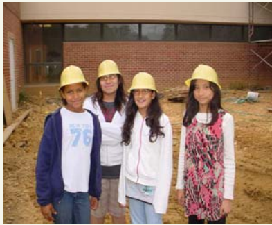
Always wear your hard hats!

Are you tired of playing on the field? Do you want a new playground? Well, here's some update on the construction: It should be finished around 2010.