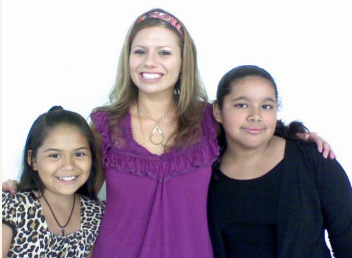
What a stylish group of women!