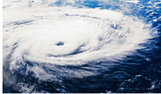
Hurricanes can be really destructive!

A waterspout resembles a tornado over water. In